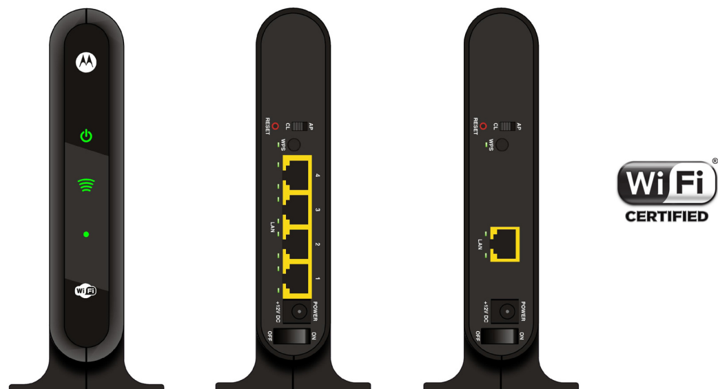
Figure 1. The VAP2400 is available in a four-port or a single Ethernet port configuration

Since the VAP2400 is available with either a single Ethernet port or in a four-port Ethernet configuration, the subscriber can network-enable additional Ethernet devices in additional rooms—such as gaming consoles, video consoles, over the top video appliances, video cameras and Internet radios—by selecting the VAP2400 four-port configuration and plugging these devices into the RJ-45 Ethernet ports to connect them over the wireless network. Introducing the VAP2400 will drive down service provider operations costs while allowing network operators to improve customer satisfaction levels by offering consumers greater flexibility in where they enjoy their video programming throughout their homes.